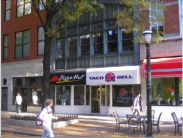
63 Broad Street NW